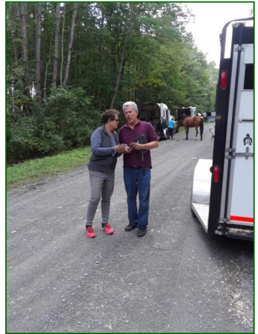
Dealers conferring at the poker run

7. Jane-Marie was finally able to talk to someone at Cazenovia College and they were helpful, excited and interested in having us. There is stabling for 45 horses, the rings are excellent, they have food services, they are in our region and they are incredibly affordable. The board voted to proceed with asking (continued)