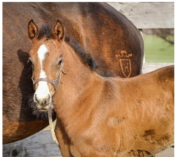
Tia, born April 1, 2020, by Valentino (Vancouver, BC) out of Molly. Owned by Finger Lakes Equestrian Center