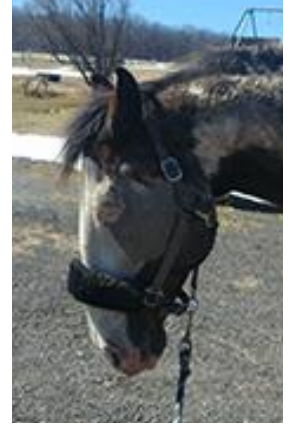
The dirtiest equine: Colleen Hanley-Price