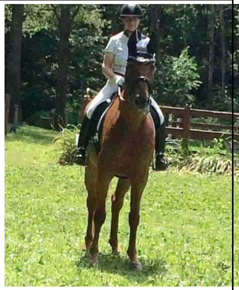
Clifford (Sam's Valentine)