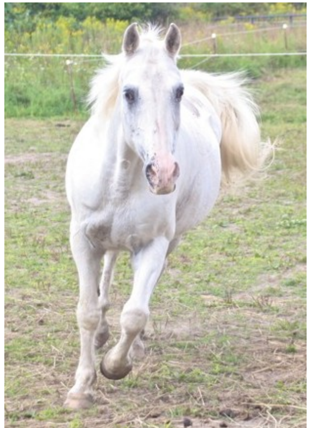
Corky, a wonderful ordinary horse.

You do not have to be good. You do not have to walk on your knees for a hundred miles through the desert, repenting. You only have to let the soft animal of your body love what it loves. Tell me about despair, yours, and I will tell you mine. Meanwhile the world goes on. Meanwhile the sun and the clear pebbles of the rain are moving across the landscapes, over the prairies and the deep trees, the mountains and the rivers. Meanwhile the wild geese, high in the clean blue air, are heading home again. Whoever you are, no matter how lonely, the world offers itself to your imagination, calls to you like the wild geese, harsh and exciting- over and over announcing your place in the family of things.