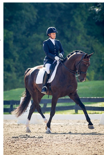
at Saugerties 2013 4th Level Test 2