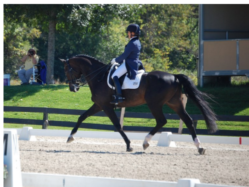
Photo taken at NEDA Fall Festival 2013 Prix St George