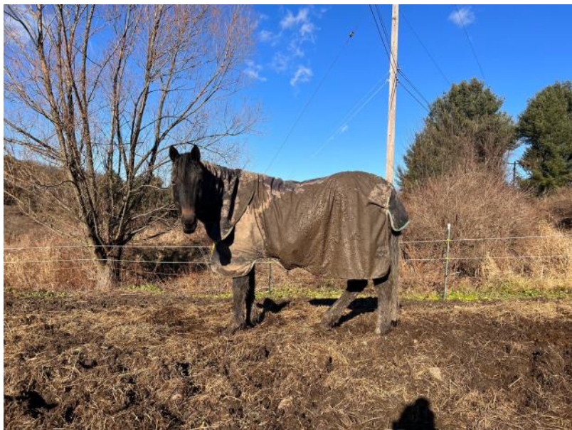
Happy Mud Season!

My hope for this year is to facilitate learning opportunities for our membership and local community. There are many resources available to us for hosting events. Our membership also includes a breadth of knowledge - equine nutrition, agriculture, equine drug testing, barn management, veterinary medicine, successful lesson programs, horse training and restarting, and so much more. Through hands-on activities, riding opportunities, virtual learning, and even through our book club, I hope everyone can learn something new while potentially growing our membership. Make sure you join our Facebook group for the most up to date information. Hope to see you all virtually at our first meeting of the year!